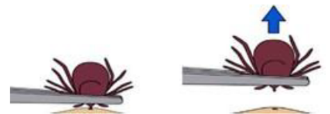
Image Description: How to remove a Tick with tweezers

For more information call 905-799-7700 or visit: peelregion.ca/health/protecting/bugs .